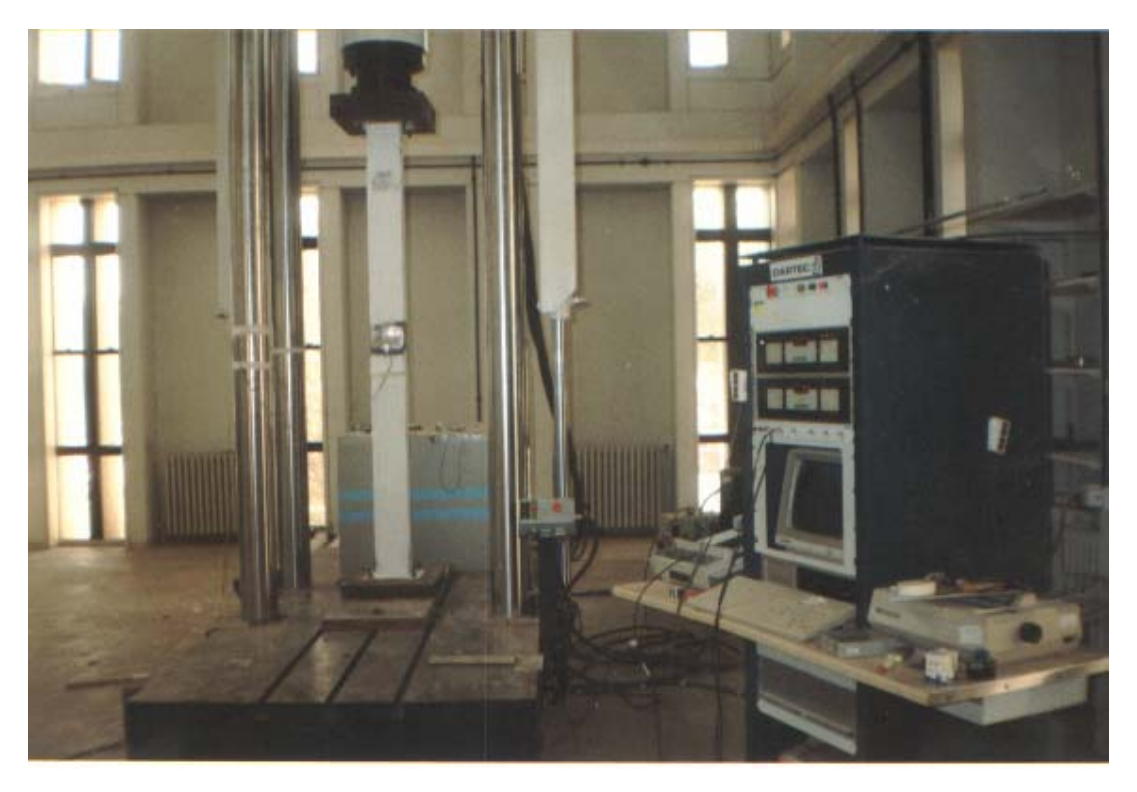
Figure (3.2): General view of the test rig