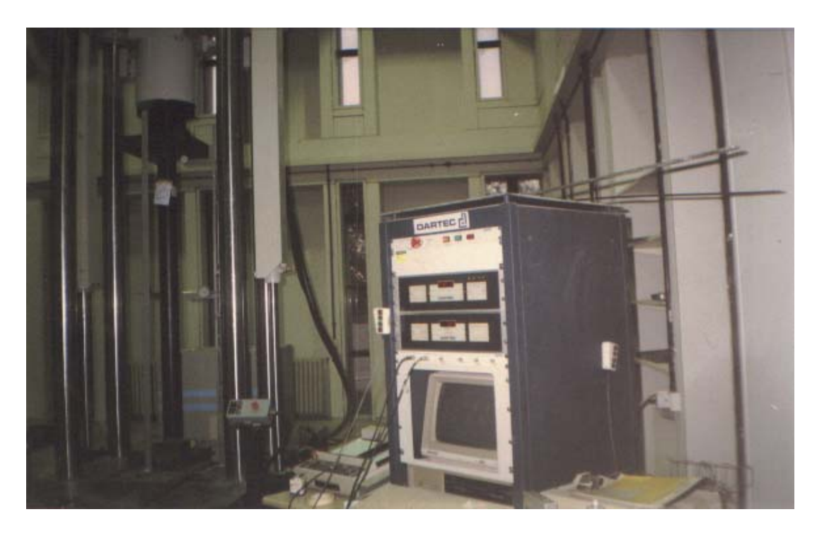
Figure (3.1): Data acquisition system